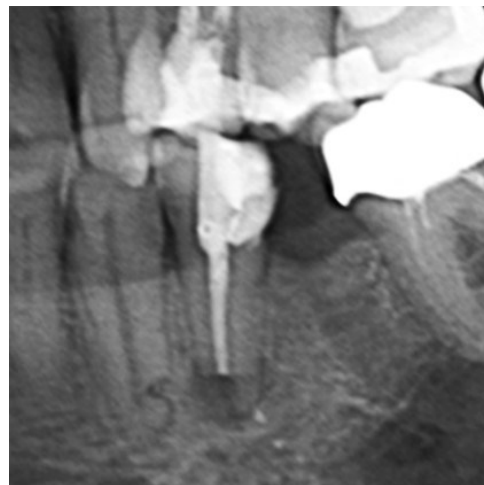
Fig. 2: X-ray five years after damage: recovery of root 33

Conclusion: There is a chance of recovery in case of unintended severe apical damage to single rooted teeth.