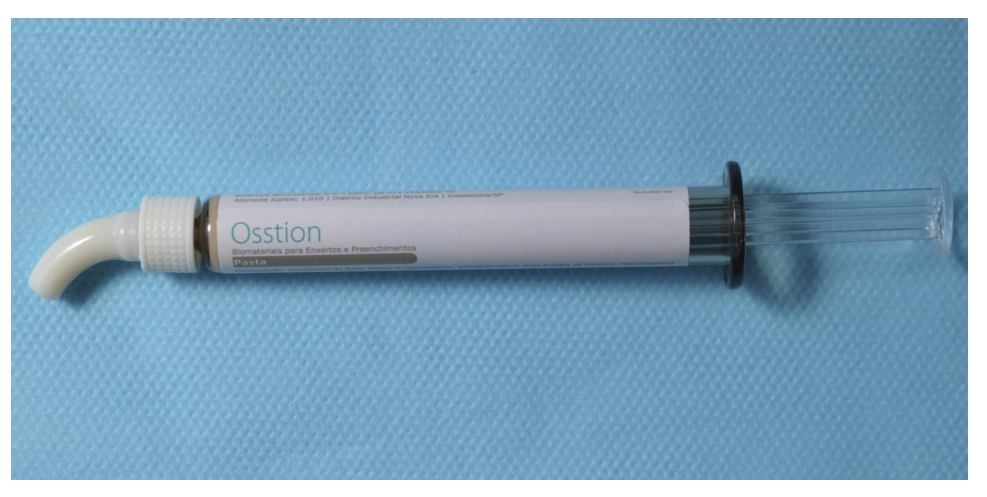
Figure 1: Primary packaging of the composite biomaterial in the form of injectable paste for bone grafting (Osstion Pasta™, Bioactive Biomaterials).

The paste interacts rapidly with the blood clot, promoting direct contact with the ceramic elements of the product. The material is gradually absorbed and integrated during the bone repair process. Over the course of weeks, the new tissue grows in the desired location. As it is an absorbable product, the need for a second surgical procedure, normally required to remove non-absorbable materials, is eliminated. The paste favours the possibility of precise application of the bio-material in the injured area, offering excellent handling properties and biological performance. It may be used alone, or in association with autologous materials or other biomaterials. The consistency of the product provides easy adaptation and adherence to the defect and allows complete permeation of the blood. It is recommended to cover the paste with a membrane (collagen or synthetic) as a mechanical barrier (Figure 2). Likewise, it is necessary that the soft tissue flap completely covers the membrane avoiding tension, cracking, or ischemia of the mucoperiosteal flap<sup>8</sup>.