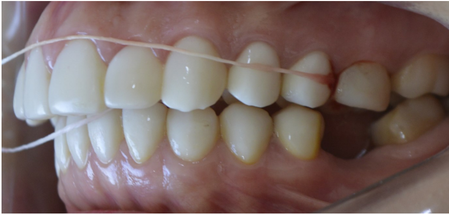
Figure 3: Gingival bleeding when flossing adjacent to cervical excess, indicating the presence of periodontal disease.