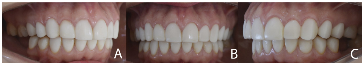
Figure 1: Clinical case showing contact lenses on upper and lower teeth, with excess in the cervical regions.

Dental contact lenses are minimally invasive restorations with little or no preparation and a thickness of 0.2 mm. The dental surgeon can modify the shape, increase the size and reduce diastemas between teeth 1,5,6-11 .