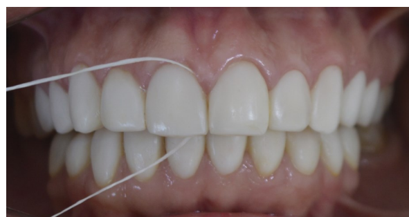
Figure 2: Retention of dental floss due to excess in the cervical region.