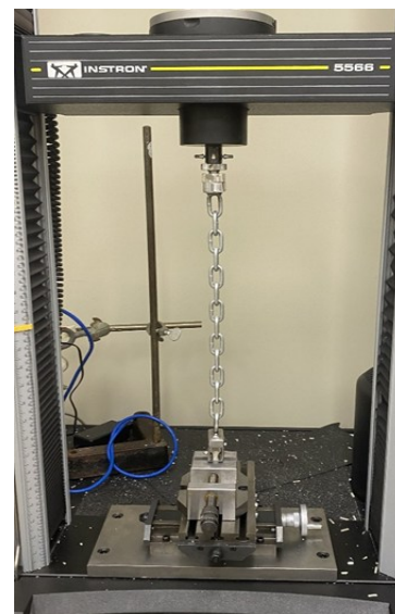
Figure 5. Mounted specimen in the Instron universal testing machine.

Positive Control (PC, n=10): an endodontic access preparation was created using a predesigned pattern to standardize the access hole in all the crowns following the ADEX dental exam guidelines for an anterior endodontic access preparation. The depth of the access into the die was to the level of the cemento-enamel junction (CEJ). After the endodontic access preparation, the access hole was restored with a cotton pellet and temporary restorative material (Cavit). Crowns were displaced similar to the NC group.