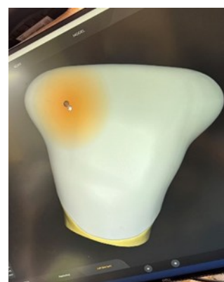
Figure 1. Design of the anterior zirconia crown with two wings to aid in the crown removal by the Instron Machine in a CAD software

In the present study, anterior tooth dies were printed out of 3D printable resin (Sprintray Ceramic Crown, Sprintray, CA) in a DLP-printer (Pro2, Sprintray) from a master model of a maxillary central incisor, which had uniform circumferential internally rounded shoulder marginal preparation of 1.0 mm depth and total occlusal convergence of 12 degrees with rounded edges. After fabrication of the tooth dies, crowns with axial wall thicknesses of 1 mm and incisal thickness of 2 mm were designed in a CAD software (inLab, Dentsply Sirona, NC) with two wings on the proximal surface (Fig 1). A central incisor crown was designed in a CAD software with two wings for crown removal with an Instron machine. Crowns were then dry milled using a translucent zirconia (VITA YZ XT, VITA North America, CA) containing 5 mol% yttria (5Y). Crowns were sintered in the furnace (inLab Profire, Dentsply Sirona) using the manufacturer's recommended sintering cycle. Thirty total crowns (Fig 2) were fabricated (n=10 per group).