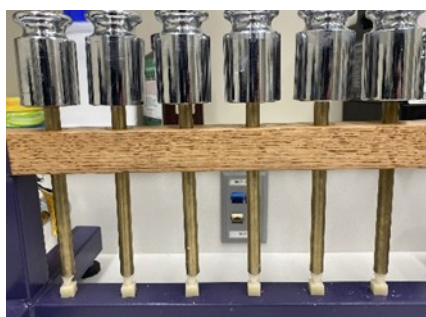
Figure 3. Cemented crowns under constant load of 1000 gram.

Negative Control (NC, n=10): no access hole was created, and the crowns were removed by the universal testing machine (Instron 5566, Norwood, MA) utilizing a custom metal jig (Fig 4) fitting to the proximal surfaces of the crowns with cross-head speed of 0.5 mm/min until displacement (Fig 5). The highest force of displacement was then recorded in Newtons.