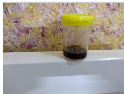
Figure 8: Urine colour turned black after 24 hours.