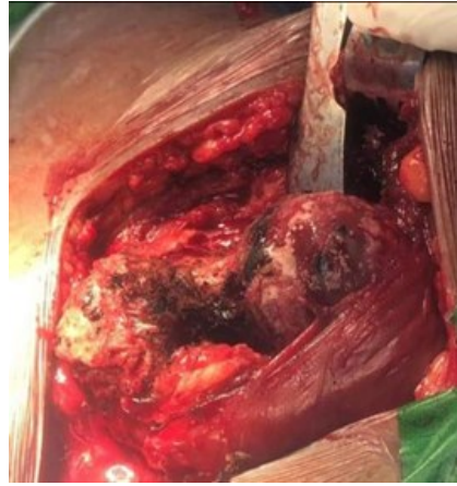
Figure 2: Black pigmentation over the greater trochanter and part of the articular surface of the hip.