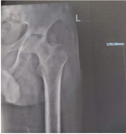
Figure 1: X-ray of the left hip, showing OA hip.