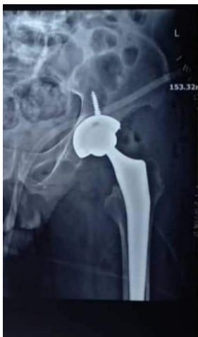
Figure 4: Left cementless ceramic on poly THR.

The excised femoral head was not sent for histopathology, it was kept in formalin (Figure 5, 6), a urine sample was taken from the patient after his permission and kept for 24 hours, its colour changed from yellow to black and this confirmed the diagnosis (Figure 7,8)