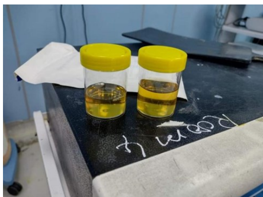
Figure 7: Urine sample was collected from the patient.