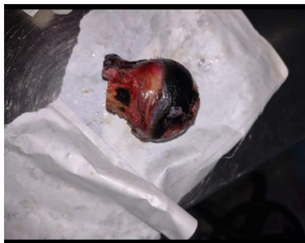
Figure 5: Excised left femoral head, note the black discoloration.