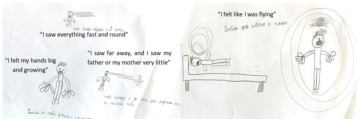
Figure 1: Clinical case 2: representation in drawing of visual complaints.

The third case was a 6-year-old boy, previously healthy, that went to a private medical office appointment with perceptive visual changes that initiated during SARS-CoV-2 infection, lasted a few minutes, and that were described as follows: "I saw things that were far away and then came closer" and "I saw people's heads small" (Fig. 2). No history of any similar event in the past has been identified. He had been previously checked in an Ophthalmology appointment, without changes. He denied personal and familiar history of epilepsy or migraine. He was not submitted to any complementary exams and AIWS associated with SARS-CoV-2 infection diagnosis was established. In several clinical follow-up consultations, no similar complaints were mentioned again.