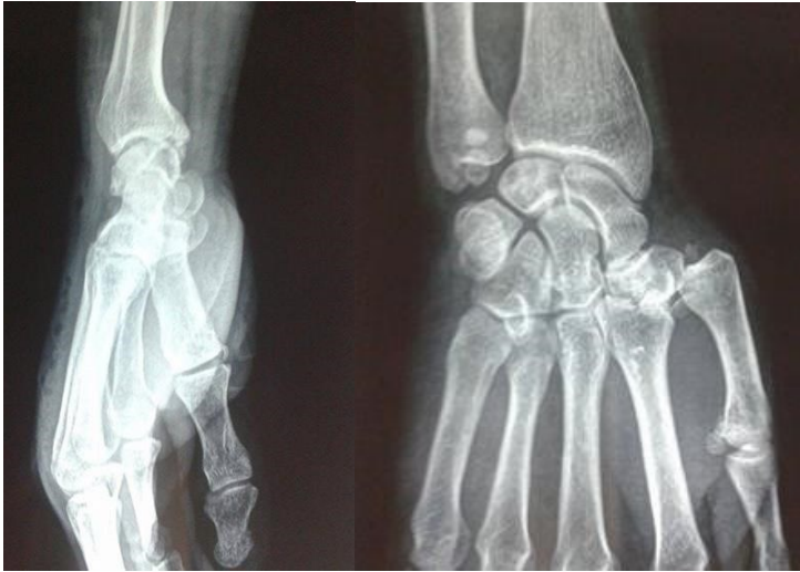
Figures 1 and 2: First metacarpal fracture.