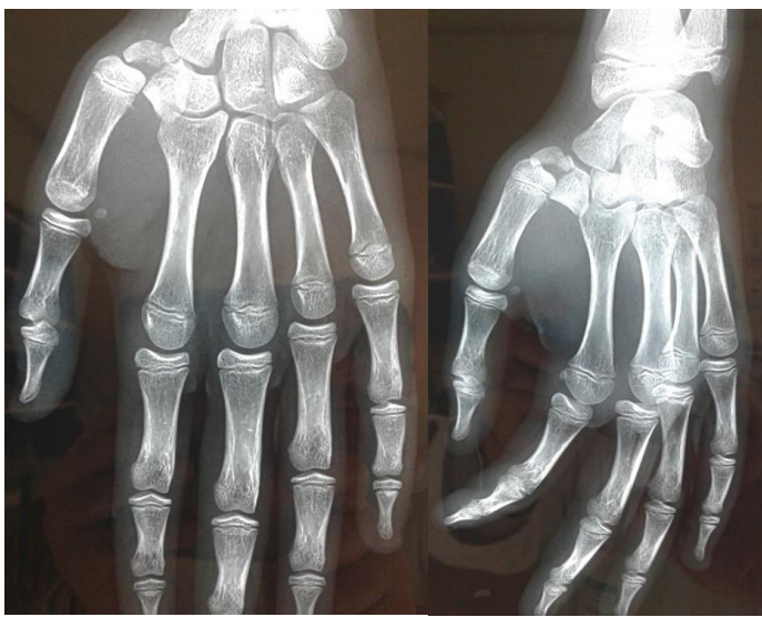
Figures 4 and 5: Fracture of the trapezium associated to trapezo metacarpal dislocation.