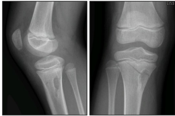
Figure 1: Tibia proximal metaphysis fracture (non-ossifying fibroma local fragility)