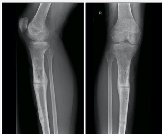
Figure 5: Final distraction osteogenesis at CORA level