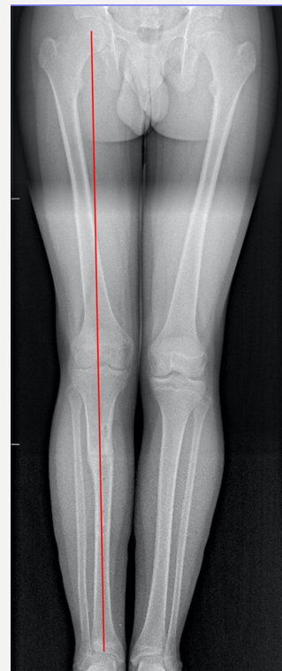
Figure 4: Final proper limb realignment (mechanical axis)