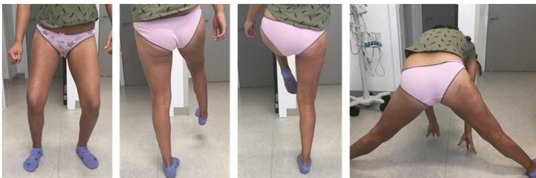
Figure 4: Mobility after external fixator removal, removal at 15 years old.

With these clinical and radiological evaluations, a pelvic support osteotomy was planned and performed at the age of 15 (figure 3). The fixator was removed 10 months after surgery, and her LLD was compensated. Trendelenburg and hip mobility were improved, allowing her to perform daily living activities and sports without pain (Figure 4).