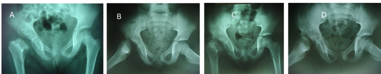
Figure 1: Pelvis radiography anteroposterior (A) and Lowenstein (B) at 4 years. Shows the difference after Dega Osteotomy with pelvis radiography anteroposterior (C) and Lowenstein (D), after 3 years of follow up.

At the time of her referral, she was 4 years old, she complains of coxalgia with mild effort such as walking two blocks, but not at rest or at night, but in instrumental activities of daily living (IADL) she was unable to perform physical and recreational activities, for example, riding a bicycle. In the initial physical examination, she presented: claudication, positive Trendelenburg of the right hip, abduction 10°, internal rotation 20°, flexion 100° and a LLD of 20 mm. The simple anteroposterior hip X-ray and Lowenstein show a completely compromised femoral epiphysis, with a small anterolateral cartilaginous vestige, acetabular deficit, and subluxation (Figure 1 A and C). MRI verifies what was shown in the x-ray (Figure 2).