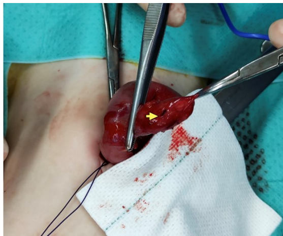
Figure 2. Meckel's diverticulum 40 cm from the ileocecal valve, perforated in its middle third (arrow).