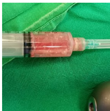
Figure 3: Syringe showing aspirated lesion contents being cheesy white material.

As the lesion was in close proximity to the cardiac structures, therefore, the cardiothoracic team was taken on board. The child underwent median sternotomy, the lesion meticulously dissected off its surroundings, especially the left innominate artery, to which it was densely adherent. The aspiration of lesion contents was done revealing cheesy white material raising the possibility of it being tuberculous (Figure 3). The lesion was removed (Figure 4) and sent for histopathology which later revealed epithelioid cell granulomas with necrosis, therefore, diagnosis of tuberculosis was entertained.