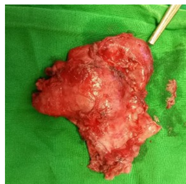
Figure 4: Anterior mediastinal lesion excised in toto.